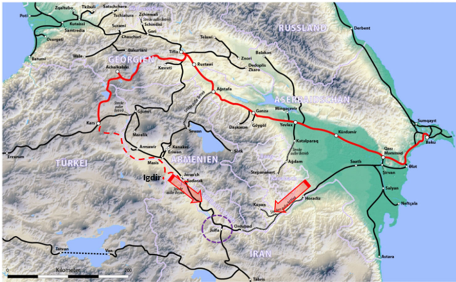
Fig.2. Complete railroad blockade of Armenia (Kars-Igdir-Nakhichevan), or integration in “East-West” and “South-North” network (Julfa/Jolfa railroad junction)

starting with the Baku-Tbilisi-Kars railroad (BTK), which became operational on 30 October 2017 (red line, Fig.2). BTK was intended to provide an alternative link between Azerbaijan and Turkey via Georgia, carefully bypassing Armenia.