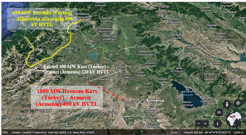
Fig.1. HVTLs, Turkey, Georgia, Armenia

However, we believe, that this process has come to nothing also because it was lacking “structural stability” in it. It was not backed by proper infrastructural base. With the bitter taste of a missed opportunity, today we must admit, that back then there was such an opportunity – we are talking about regional HVTL network. Indeed, HVTLs are the least politicized segment of infrastructure, where solutions can be found quickly, without going deep into complicated geopolitical and political problems, so typical for the “opening of the borders”, railroads, or oil and gas.