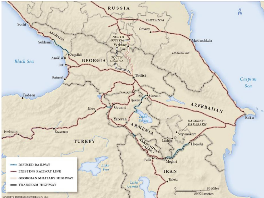
Source: South Caucasus Transport Routes / Carnegie Endowment for International Peace