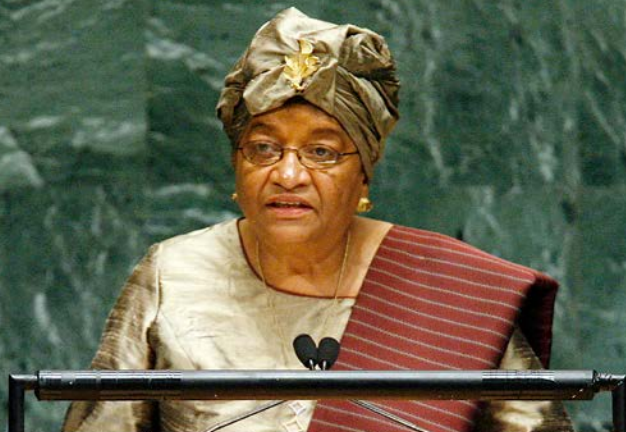
Ellen Johnson-Sirleaf, President of the Republic of Liberia and Nobel Peace Prize Laureate