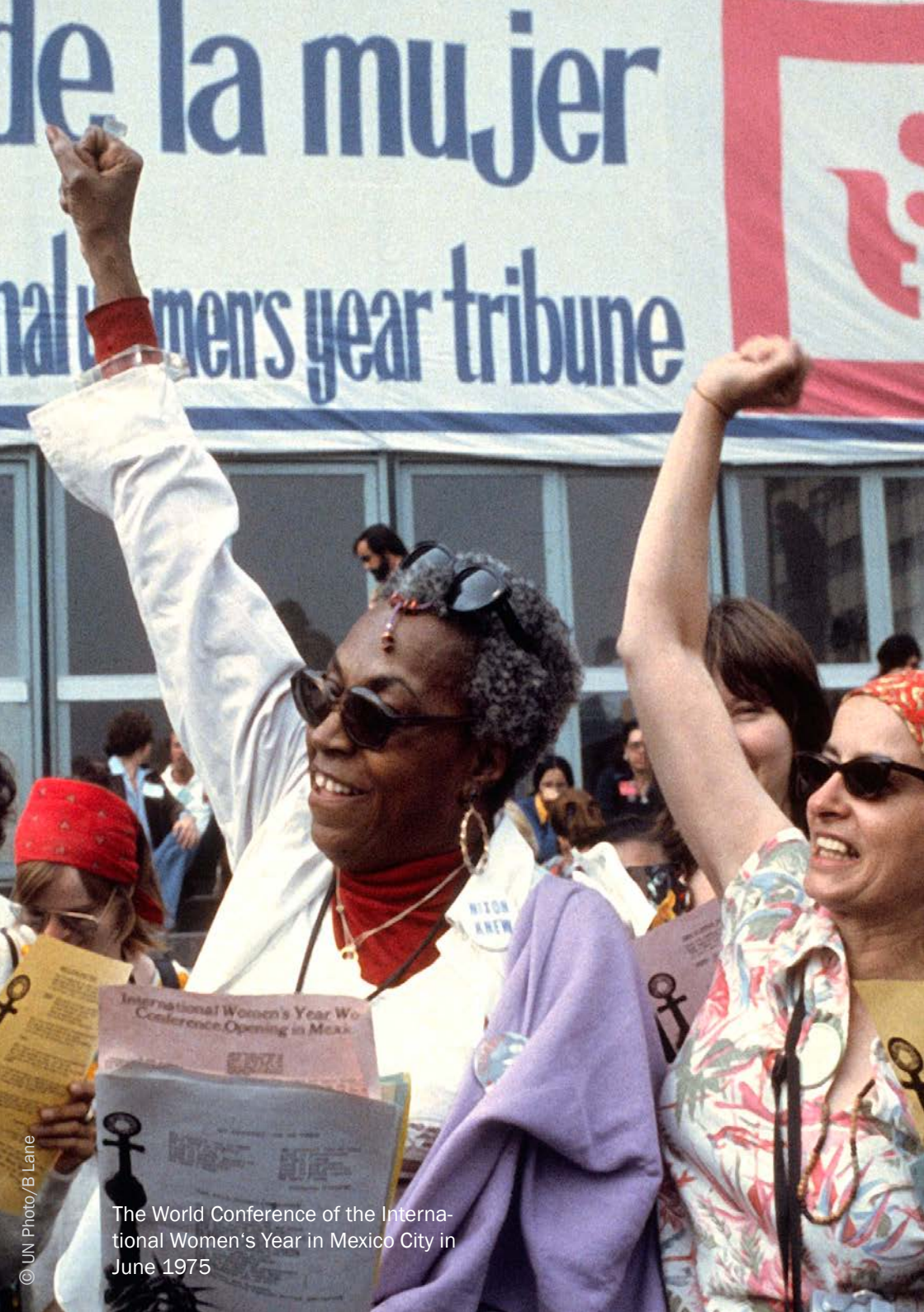
The World Conference of the International Women's Year in Mexico City in June 1975