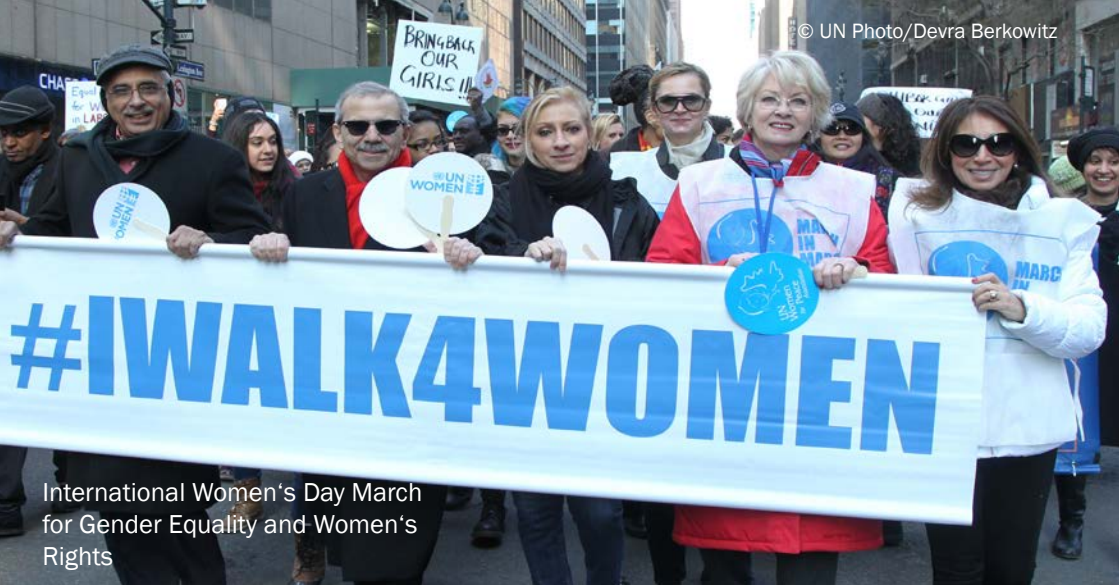
International Women's Day March for Gender Equality and Women's Rights