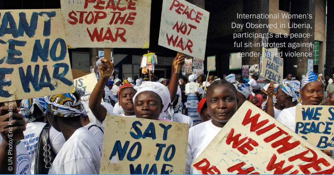
International Women's Day Observed in Liberia, participants at a peaceful sit-in protest against gender-based violence