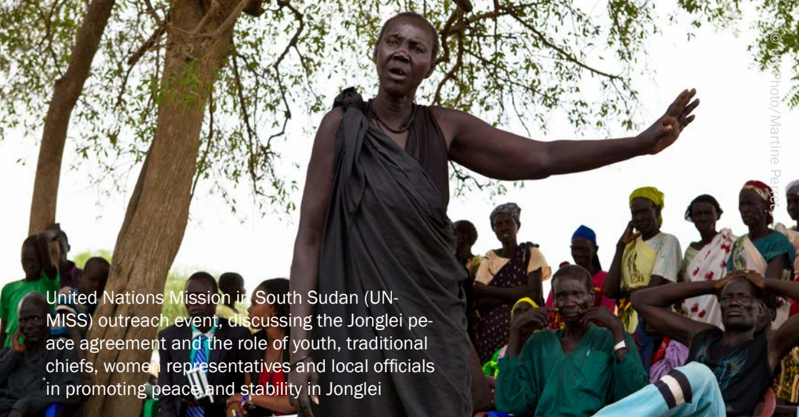
United Nations Mission in South Sudan (UNMISS) outreach event, discussing the Jonglei peace agreement and the role of youth, traditional chiefs, women representatives and local officials in promoting peace and stability in Jonglei