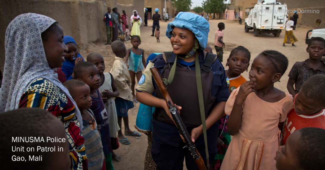
MINUSMA Police Unit on Patrol in Gao, Mali