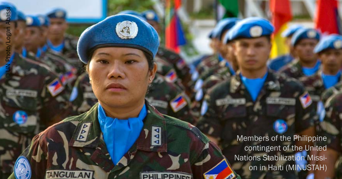
Members of the Philippine contingent of the United Nations Stabilization Mission in Haiti (MINUSTAH)