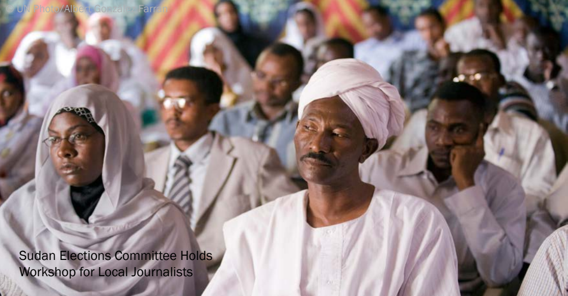
Sudan Elections Committee Holds Workshop for Local Journalists