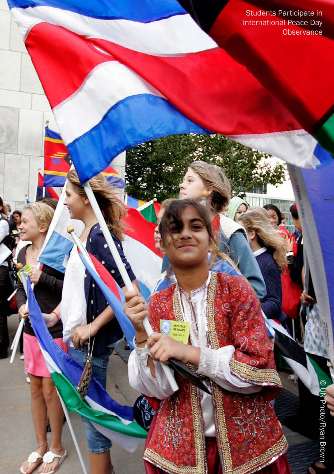
Students Participate in International Peace Day Observance