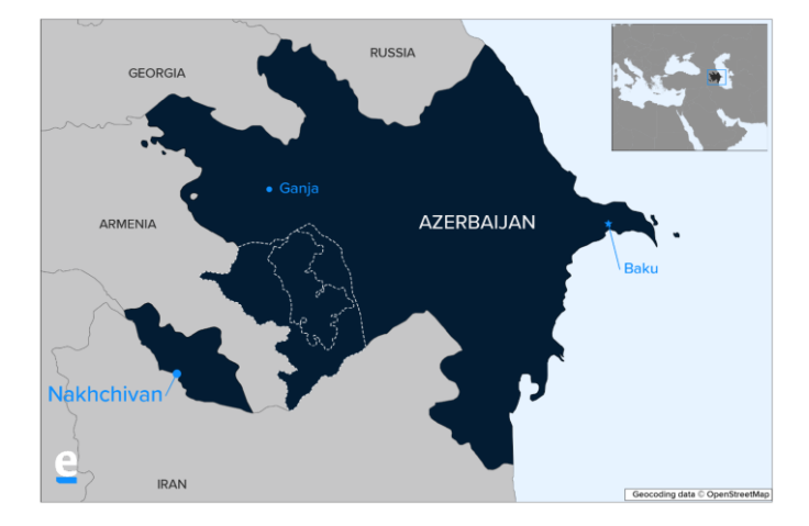
Fig. 4: Azerbaijan; Source: <http://www.turan.az/ext/news/2018/11/free/ Wantpercent20topercent20Say/en/76665.htm>.

US sanctions however are going to have hit Armenia hard, as the latter is landlocked and without a wide range of regional political options. Even that the bulk of Armenia's gas imports is being provided by Russia, via Georgia, the country still is importing heavily from Iran. In 2017 Yerevan has imported around 400 million cubic meters of Iranian gas. The latter deal is based on an agreement that Iran received power from Armenia. Since the end of 2017, Armenia is setting up a strategy to increase its Iranian gas imports by around 25 percent.<sup>5</sup> Even if both countries have signed a natural gas-power agreement, a lot is still unclear. If sanctions will partly constrain the Iranian gas pipeline network is owned by Russian gas giant Gazprom. If Washington forces Armenia to end its Iranian connections, the country will become solely dependent on Russia's power plays.