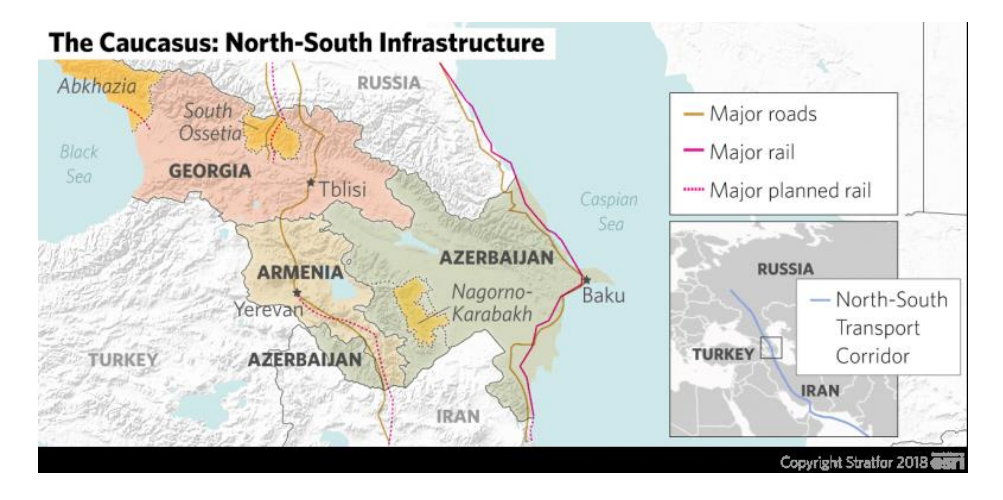
Fig. 2: The Caucasus: North-South Infrastructure; Source: <https://worldview.stratfor.com/article/caucasus-competition-will-limit-cooperation>.

Source: <https://worldview.stratfor.com/article/caucasus-competition-will-limit-cooperation>.