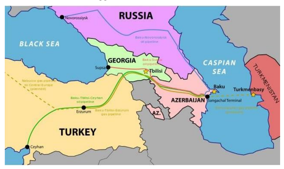
Fig. 3: South Caucasus Pipeline.

However, the Southern Caucasus, when looking from a geopolitical realism approach, has been added to the top priority list of Europe-US military thinking. The land bridge, as some are looking at the region, plays a major part in international efforts to counter international terrorism, human trafficking and potentially blocking proxy-wars of others. Azerbaijan has been incorporated by all in their respective security strategies, shown by the fact that Azerbaijan has been an active participant in various programs of international cooperation to ensure security in the region. Azerbaijan at present has an in-depth cooperation with NATO, as shown by the country's contribution to the NATO International Security Assistance Force (ISAF), participation in NATO operations KFOR, ISAF, and Azerbaijan's contribution to the Resolute Support Mission.