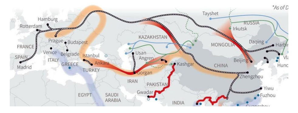
Fig. 5: China Silk Road;

sors from Russia, China, and India took part. Tehran has been trying to set up a multilateral framework for Eurasian security cooperation. Even though officially Afghanistan was the prime focus of the summit, parties have agreed to a wide-sweeping stabilisation agenda extending from Syria eastward to include all of Central Asia. The red-line in all has been Iran's role in the so-called emerging architecture of Eurasian commercial connectivity, which is based on the ongoing Belt and Road Initiative (OBOR) of China. Iran has been very active to play a pivotal role in the establishment of secure transit routes using existing infrastructure as well as creating new infrastructures.