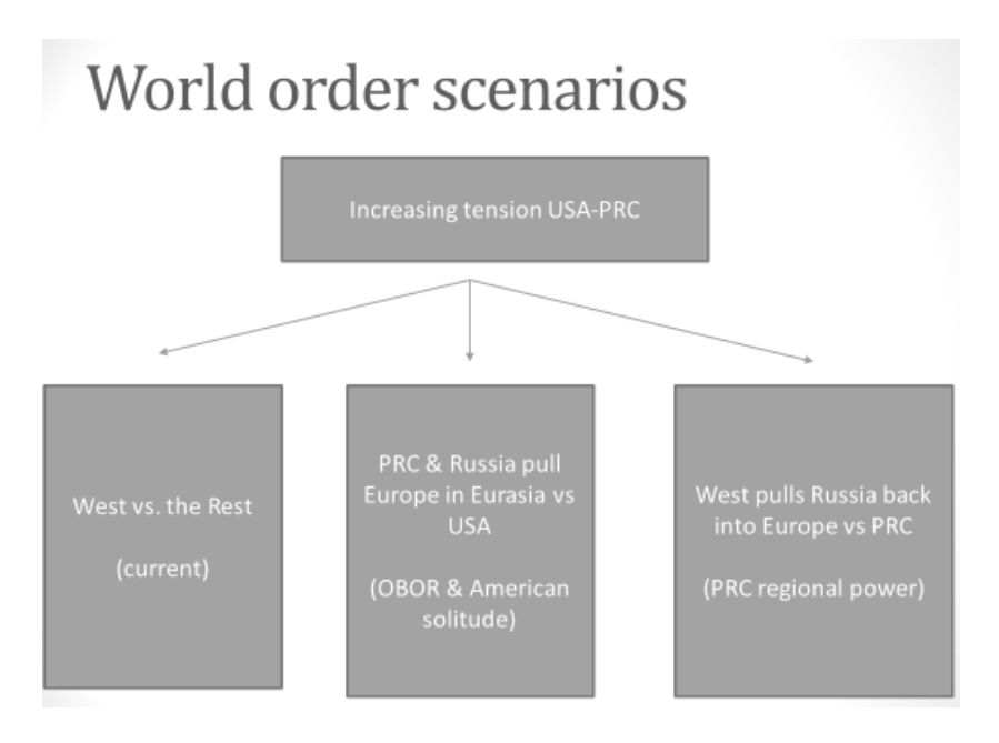
Fig. 1: Drivers and challenges of the multipolar order

Trends in the transient international order are no longer characterised by the search for democratic, law-based institutions enhancing universal human rights.<sup>5</sup> Persistent instability is due in part to a backlash that aims to reestablish the traditional social-political centrality of the nation-state. Instead of enhancing and projecting democratic and internationally agreed governance or strengthening multilateral agreements and networks, the focus of national actors has now shifted. Stability and security have replaced the objective of enhancing democracy.