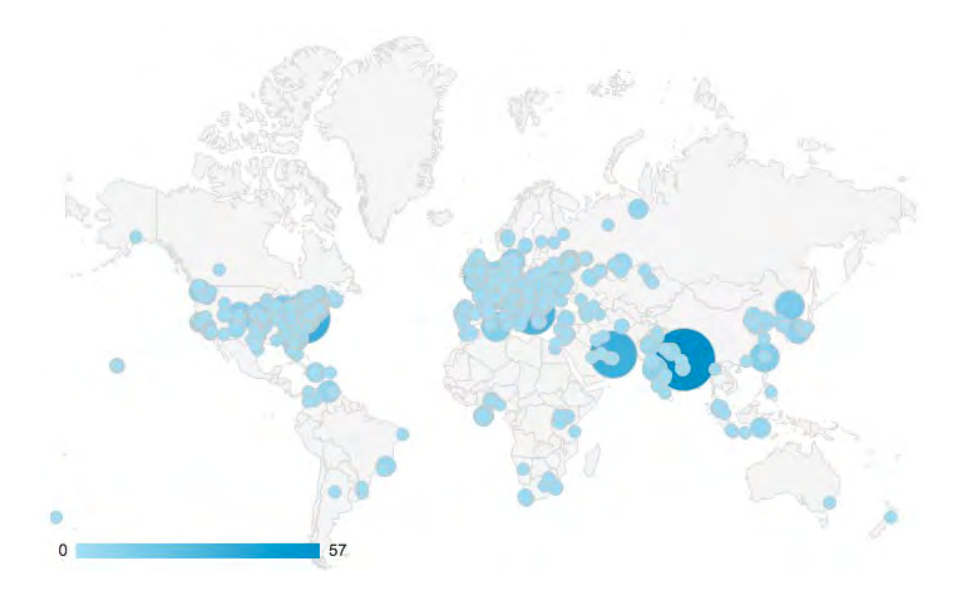
Table 2: Map of Cities with Most Usage by Sessions, 2014