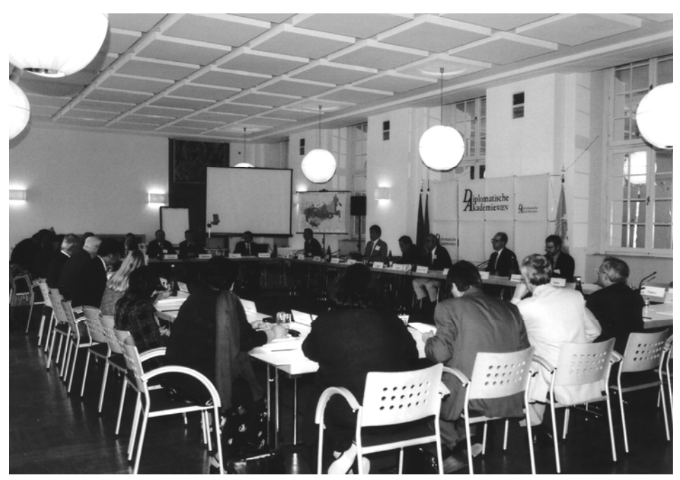
32nd International Peace Academy Vienna Seminar

Central Asia's First Decade of Independence. Promises and Problems 4-6 July 2002 Diplomatic Academy of Vienna