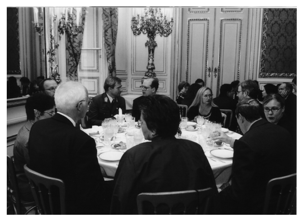
Dinner at the Palais Pallavicini

Currently, the chances for enhanced regional co-operation in Central Asia appear limited, despite the efforts of major countries from the outside and international organisations to promote change. In the discussion we may wish to address the EU efforts to promote regional co-operation in particular.