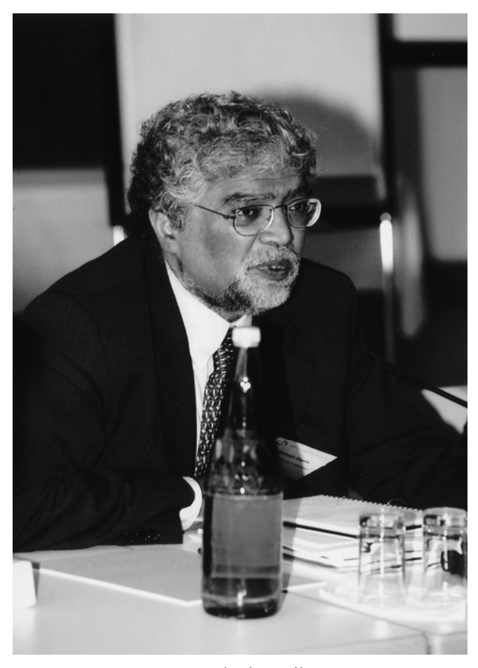
Dr. Mukesh Kapila

Today Central Asia is going through a difficult and important stage in its development. Central Asian states confront the challenges that will have great implications not only for the region but for the entire international community. Therefore, it is of exceptional importance to support the States of Central Asia in their aspirations to make their region more stable and fully integrated into the modern international political and economic processes.