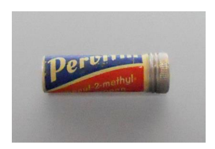
Figure 1: Tin of Pervitin.

Crystal or crystal meth deserves a special mention: These scene names designate methamphetamine, a fully synthetic stimulant produced in back-street laboratories, which was synthesised as early as 1893 by the Japanese chemist Nagayoshi Nagai. It was patented in 1920; and, until the 1980s, it was sold in pure form as a drug under the trade name Pervitin®. Methamphetamine is closely chemically related to amphetamine (speed), but the addiction potential of methamphetamine is considerably higher. Methamphetamine affects the metabolism of serotonin and dopamine neurotransmitters.