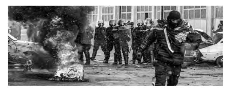
Figure 7: KFOR MSU, http://www.nspcoe.org/home.