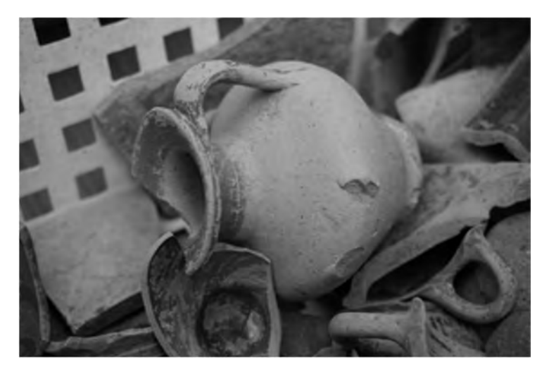
Figure 10: Offering vases 5th century BC, Polo Museale Locri, 7th underwater archaeology course 2019, photo by the author 2019.

SP within CPP encompasses, among others, recognising cultural property in the local context and contributing to geolocating it, feeding no-strike lists (NSL) and allowing to develop priorities in safeguarding and respecting <sup>30</sup> items, sites, people (e.g. artefacts and relics, museums, monuments, and ruins, archaeological digs, digital archives, collection curators and directors of museums).