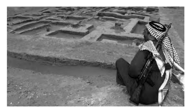
Figure 14: A man guarding a Sumerian archaeological site in Iraq from looters, photo: picture-alliance/dpa.

Developing capable, accountable, legitimate, efficient and effective IPF and, where required, the whole Justice Sector (including judicial and corrections institutions), is essential to answer the justice needs of the HN. It is key that the population they are to serve, if they have to stand a chance at achieving long-term sustainability, accepts them. This in turn is facilitated by improving their skills, capabilities and performance but most importantly, their attitude and behaviour, especially about corruption and human rights abuse.