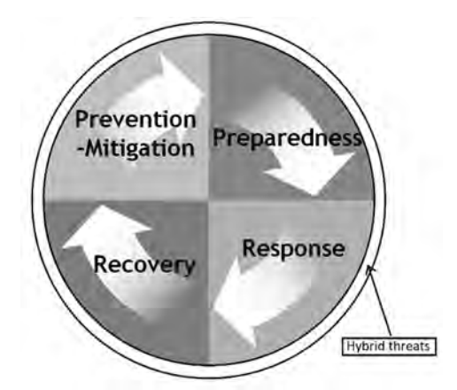
Figure 17: Disaster management cycle and hybrid threats.

In order to build up resilience it will be very important to conduct assessments and analyses of the situation regarding disaster risk reduction/DRR and disaster management in the whole region and beyond. It is absolutely necessary to include the risk of hybrid threats to disaster preparedness strategies, but they must be included in all planning phases.