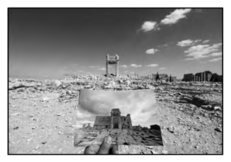
Figure 5: Ziggurat of Ur, South Iraq, photo by the author during MSU deployment 2003.

ceptance and legitimacy of the Alliance, within stakeholders from the local to the international level including NATO nations, enhancing mission sustainability.