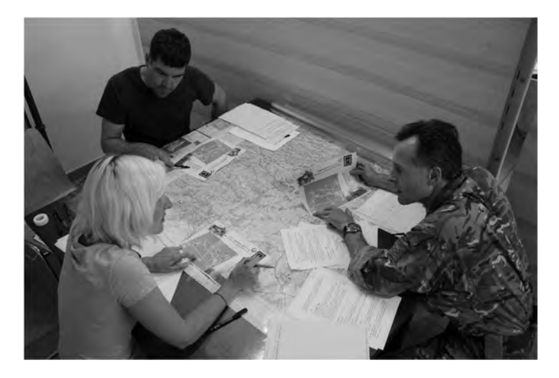
Figure 15: Description – Civilian and military heritage experts planning the recce for the former Imperial castle affected by the earthquake during exercise TRITOLIA18.

with the hands-on approach that was much valued by the participants.