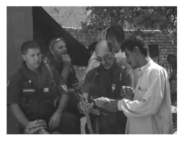
Figure 12: MSU Carabinieri TPC investigating in South Iraq, from Carabinieri TPC presentation.

Attacks on CP, due to its pivotal significance for the collective memory and community identity, may be good indicators for the security situation or the instability, since they frequently precede genocide, ethnic cleansing and a plethora of crimes of violence.