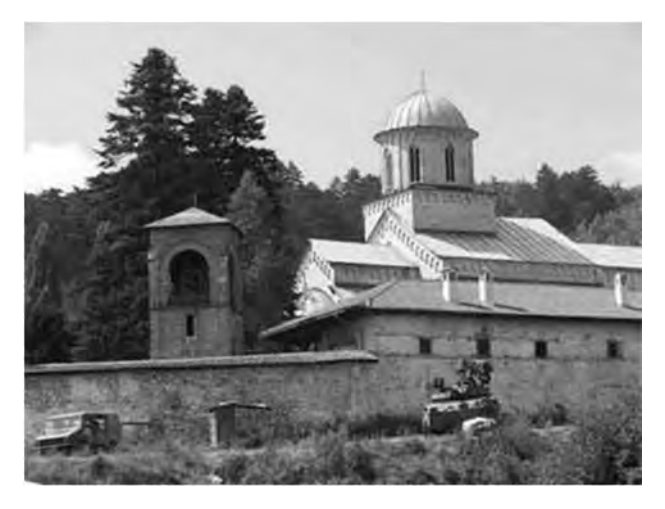
Figure 13: Italian Army guarding the monastery of Decani in Kosovo, http://www.kosovo.net/edecani_pw.html.

In order to trigger or improve the ability of the IPF in addressing CP-related policing needs of the populace and HN it is essential to assess their existing capabilities and capacity (DOTLMPFI-I<sup>35</sup>), extant threats and challenges. Then the gaps can be determined to subsequently devise ways to fill them by establishing planning, resourcing and enforcement priorities.