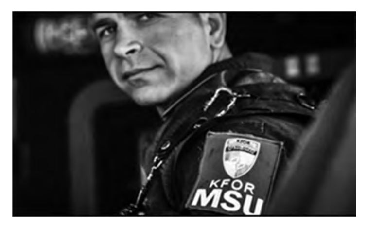
Figure 6: Palmyra, Joseph Eid, AFP/Getty Images.