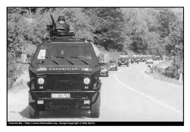
Figure 2: The first MSU travels from Ploce to Sarajevo, 1998, www.fiammablu.org.

This idea preceded the "Report of the Panel on United Nations Peace Operations", the so-called "Brahimi report" <sup>12</sup> of 2000, which concluded that "to save succeeding generations from the scourge of war" ... "is the most important function of the Organization. Over the last decade, the United Nations has repeatedly failed to meet the challenge" and formulated "recommendations focus not only on politics and strategy but also and perhaps even more so on operational and organizational areas of need." Recommendations included "preventive action"..." robust doctrine and realistic mandates"..." "oncall list" of about 100 experienced, well qualified military officers" ... "on-call lists of civilian police"..." Member States to establish enhanced national "pools" of police officers and related experts, earmarked for deployment to United Nations peace operations, to help meet the high