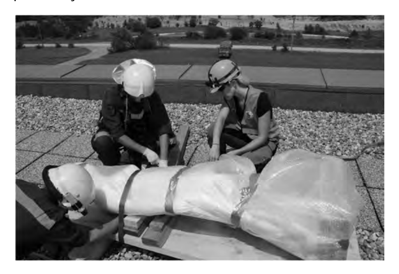
Figure 16: Description - Civil-military cooperation for the recovery of a statue from the roof of the former Imperial castle. Civilian expertise in stone conservation meets military expertise from the CBRN Defence Command's Urban Search and Rescue platoon.

ists – archaeologist, structural engineer, conservationist, data and informatics specialist, etc. Capabilities and knowledge on documentation, handling, packing, moving and storing of cultural property of all kind should be present in the team. At least the team leader and the liaison officer should be able to work in close coordination with the different emergency responders on site or the military, hence underlining the importance of training and exercises like the ones described previously.